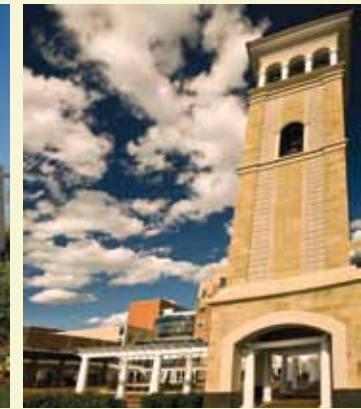
St. Francis Medical Center 13710 St. Francis Boulevard Midlothian, VA 23114 804-594-7300