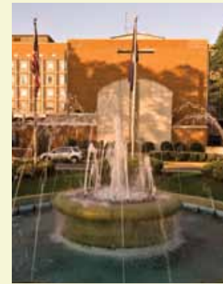
St. Mary's Hospital 5801 Bremono Road Richmond, VA 23226 804-285-2011

“From what we get, we can make a living; what we give, however, makes a life.” ARTHUR ASHE